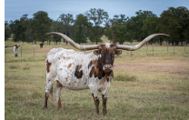
HUBBELLS BLACK BEAUTY